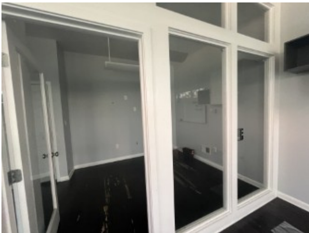
Separate Main Floor Office